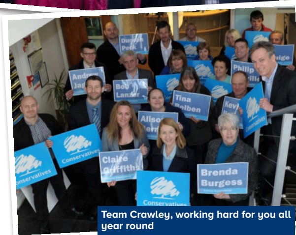
Team Crawley, working hard for you all year round