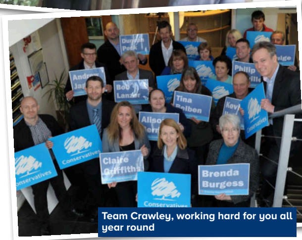
Team Crawley, working hard for you all year round