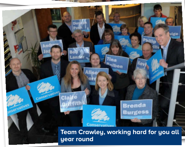
Team Crawley, working hard for you all year round