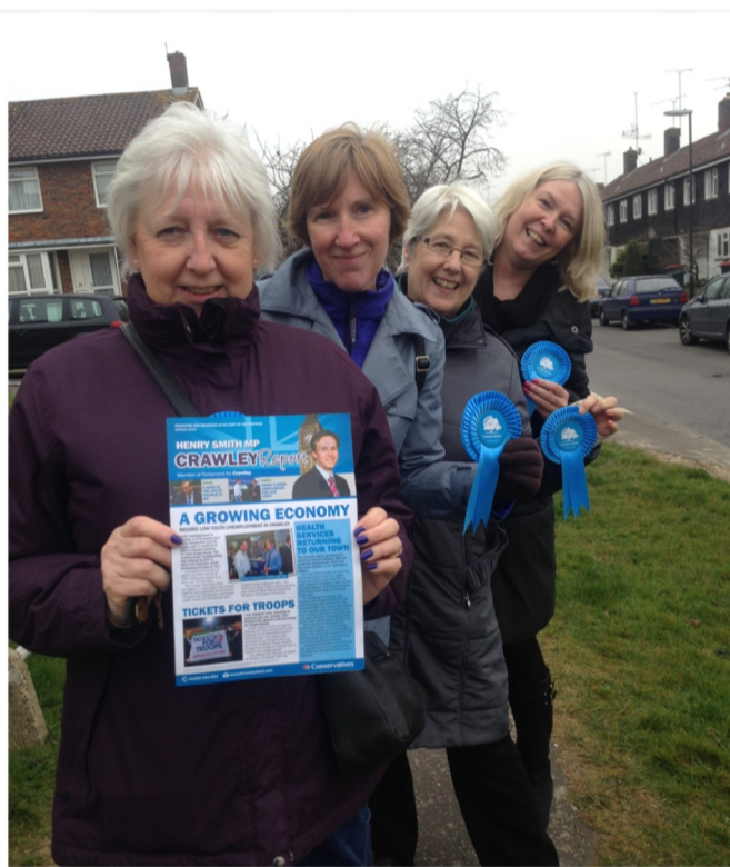
■ Some of the Conservative team out and about recently in Southgate!

You can still fill it in and take it to the polling station in person on polling day.